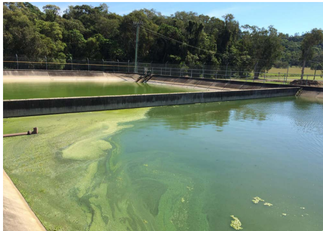
This Sludge lagoon allows the sludge to settle. Due to the large ratio of water, it is returned to the head of the work to be processed again. Due to the small population this treatment plant caters for, this tank only needs to be emptied every 5 years.