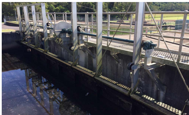
This 'Extended Aeration Tank' adds oxygen to the water which allows the bugs to eliminate the ammonia and nitrogen. The sludge which contains the microorganisms settles on the bottom. This weir board lowers enough to decant the clear water into a tertiary pond.