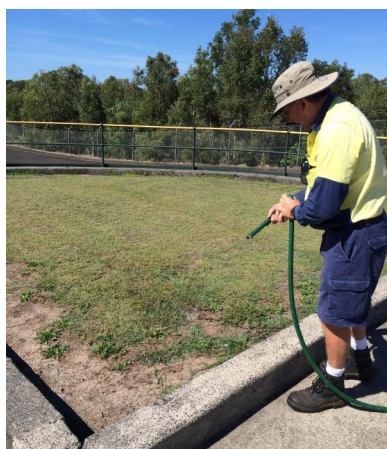
Deodorising Bed has pipes running underneath it.