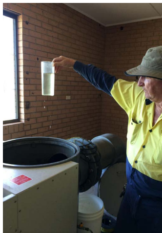
Recycled water then gets reused at: