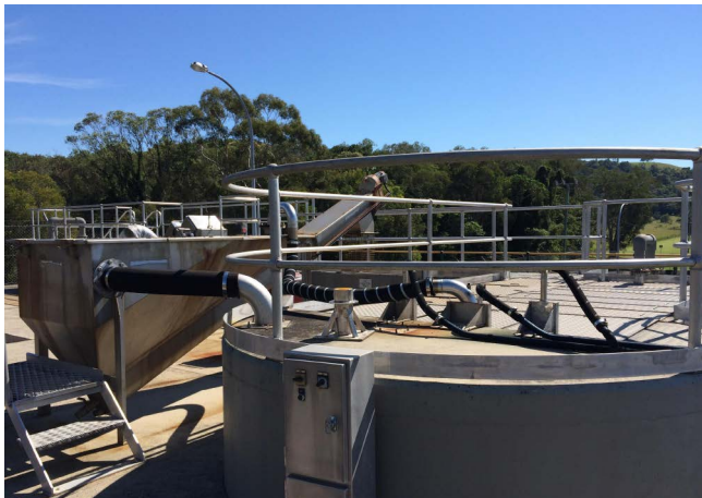
This 'Grit Arrester' creates a vortex by pumping air into the water which lifts the sand and grit off the bottom.